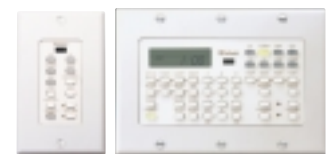
WK3, WK4 KEYPAD CONTROLLERS