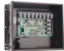
HC1 HOME CONTROLLER